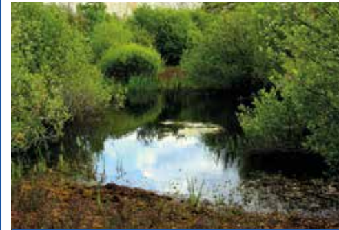
Monkton Nature Reserve