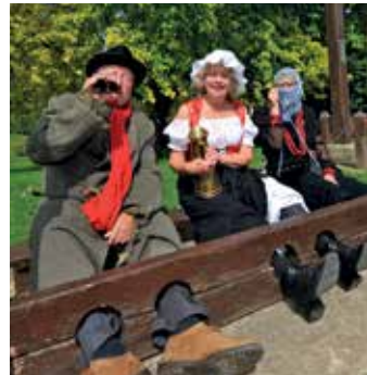
St Peter's Village Tour, Broadstairs