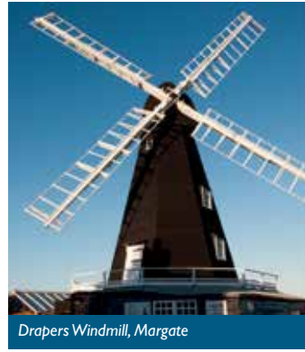
Drapers Windmill, Margate

Disabled access. Public parking and toilet facilities in Hopeville Avenue.